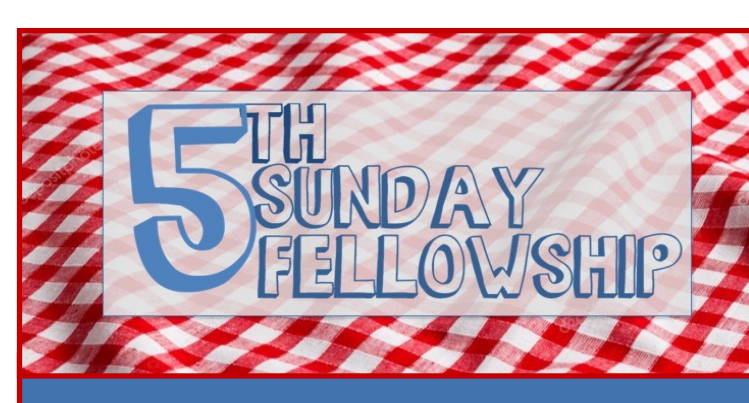
Bring a favorite dish to share for lunch Sunday, June 30<sup>th</sup> after our morning Worship.